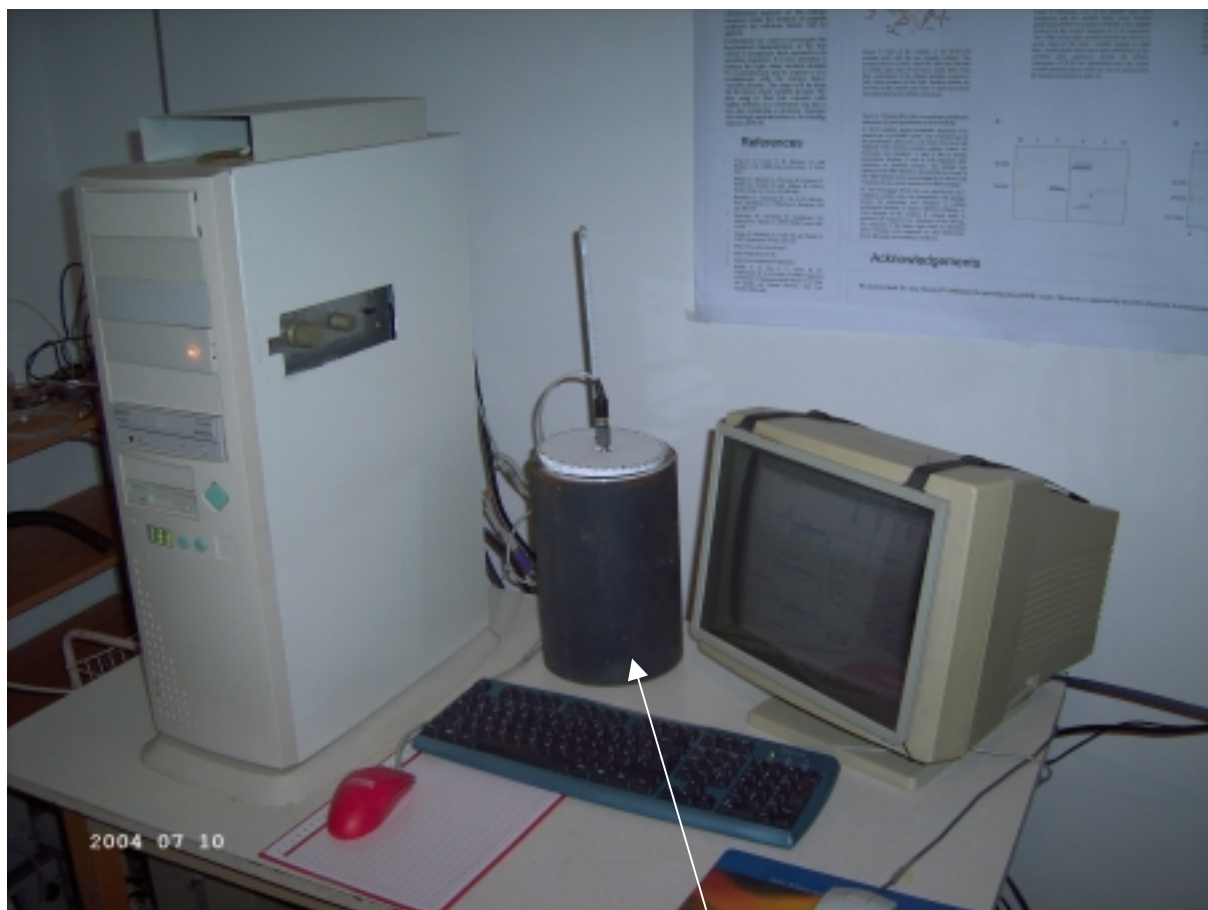
Fig. 1. General view of FNS (2004)